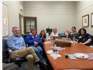
Stivers Pizza Party