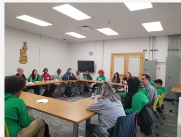
Chaminade Julienne Pizza Party