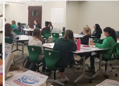
Northmont Pizza Party