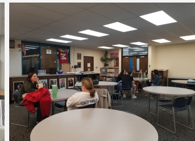
Valley View Pizza Party